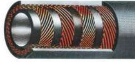
AIR HOSE 20 BAR MANDREL BUILT MEDIUM DUTY SERVICE HOSE FOR AIR AND PNEUMATIC TOOLS