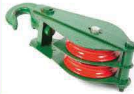
DOUBLE SNATCH BLOCK