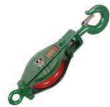
SINGLE PULLEY RIGID GREEN