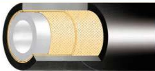
SAE 100 R7 SINGLE TEXTILE BRAIDED MEDIUM-HIGH PRESSURE HOSE FOR AIR, WATER MINERAL AND/OR SYNTHETIC OILS DISCHARGE (75 to 227 BAR)