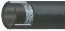
AIR HOSE 20 BAR SMOOTH COVER MEDIUM DUTY SERVICE HOSE FOR AIR AND PNEUMATIC TOOLS