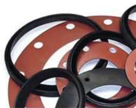
GASKETS AND O RINGS