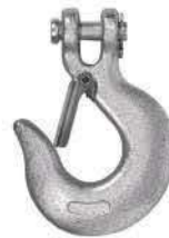
CLEVIS SLIP HOOK