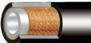
TP 1 SINGLE STEEL REINFORCED VERY HIGH PRESSURE HOSE FOR HYDRAULIC SYSTEMS USED IN VARIOUS INDUSTRIES AND AGRICULTURE (100 to 325 BAR)