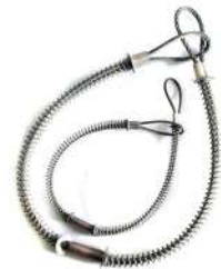
WHIP CHECK SAFETY CABLE