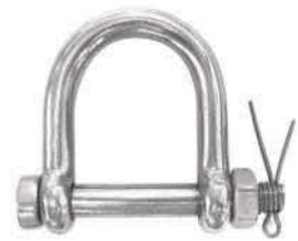
DEE SHACKLE 'C' TYPE