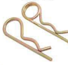
R PIN SINGLE | DOUBLE