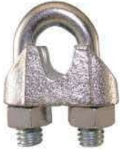
WIRE ROPE CLIP (GALVANIZED)