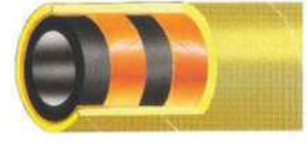
AIR HOSE 40 BAR MANDREL BUILT HEAVY DUTY SERVICE HOSE FOR AIR IN MINES AND QUARRIES