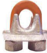
WIRE ROPE CLIP DROP FORGED