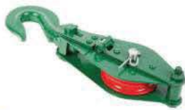
SINGLE SNATCH BLOCK