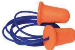
EAR PLUG (With & Without Cord)