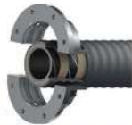
BULK MATERIAL SUCTION & DELIVERY HOSE – WP 10 BAR ABRASION RESISTANT ANTISTATIC NATURAL RUBBER HOSE FOR SUCTION & DISCHARGE OF DRY BULK MATERIALS, SAND, GRAVEL AND DRY CEMENT ETC