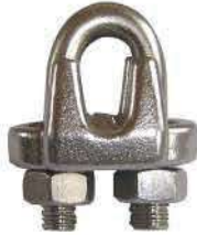
WIRE ROPE CLIP 'A' TYPE