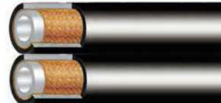
TP 1 TWIN STEEL REINFORCED VERY HIGH PRESSURE HOSE FOR HYDRAULIC SYSTEMS USED IN VARIOUS INDUSTRIES AND AGRICULTURE (100 to 325 BAR)