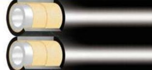
SAE 100 R7 TWIN TEXTILE BRAIDED MEDIUM-HIGH PRESSURE HOSE FOR AIR, WATER, MINERAL AND/OR SYNTHETIC OILS DISCHARGE (75 to 227 BAR)