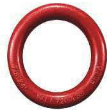
WELDLESS ROUND RING