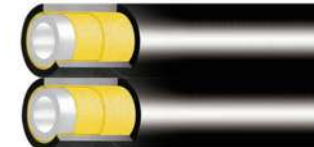
SAE 100 R8 TWIN TEXTILE (ARAMIDIC) BRAIDED VERY HIGH PRESSURE HOSE FOR AIR, WATER MINERAL AND/OR SYNTHETIC OILS DISCHARGE (140 to 362 BAR)