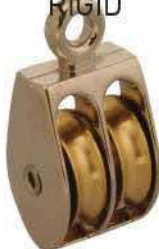
DOUBLE PULLEY RIGID