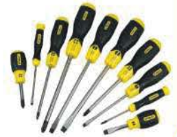
CUSHION GRIP SCREWDRIVER SETS