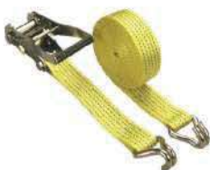
RATCHET TIE DOWN