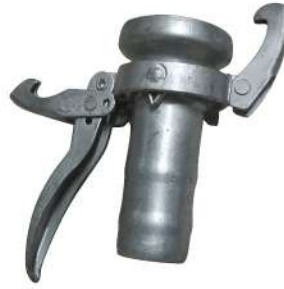
MILLER AND BAUER COUPLINGS