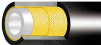
SAE 100 R8 SINGLE TEXTILE (ARAMIDIC) BRAIDED VERY HIGH PRESSURE HOSE FOR AIR, WATER MINERAL AND/OR SYNTHETIC OILS DISCHARGE (140 to 362 BAR)