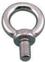
EYE SCREW (304 & 316)