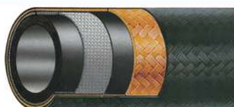
SAE J517 100 R5 FOR LOW-MEDIUM PRESSURE HYDRAULIC SYSTEMS IN INDUSTRY AND AGRICULTURE (14 to 210 BAR)