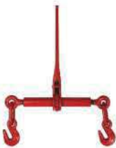
LOAD BINDER RATCHET TYPE