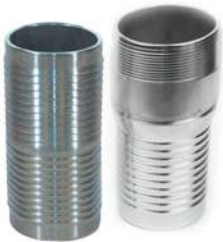
HOSE MENDERS & KING NIPPLES