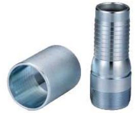
NIPPLES & FERRULES