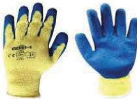
HAND GLOVES LATEX COATED