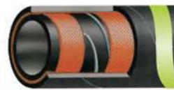
MATERIAL SUCTION & DELIVERY HOSE – WP 10 BAR HIGH ABRASION RESISTANT (70MM3 DIN 53516) ANTISTATIC NATURAL RUBBER HOSE FOR SUCTION & DISCHARGE OF BARITE, BENTONITE AND OTHER ABRASIVE MATERIALS