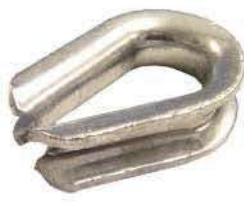
THIMBLE HEAVY DUTY